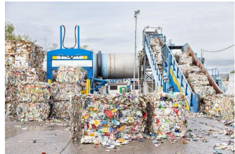
The first step of the recycling process of Alier is the pulping of the used paper sack material.

When the raw material arrives at the recycling plant, it enters the pulper where the paper is separated from any polyethylene or residue materials from the used paper sacks. The polyethylene enters the washing and extrusion sections and is processed into a granular material, which is sold on the market. The pulp is passed into the paper mill where it is made into recycled paper. Before the recycled paper is sold to converters, the quality of the paper is thoroughly tested at the mill’s laboratory. “Sack kraft paper is a very valuable raw material for us,” explains Matias Cowper Coles, Sales Manager at the paper recycler and producer Alier. “Being part of the alliance not only guarantees that we will continue to receive high-quality raw material for our production. It also brings benefits to the whole industry which profits from the combined forces and shared logistics and to the community and the environment as less material ends up in landfills.”