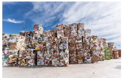
The paper sacks are prepared for recycling and stored before they are transported to the recycler.